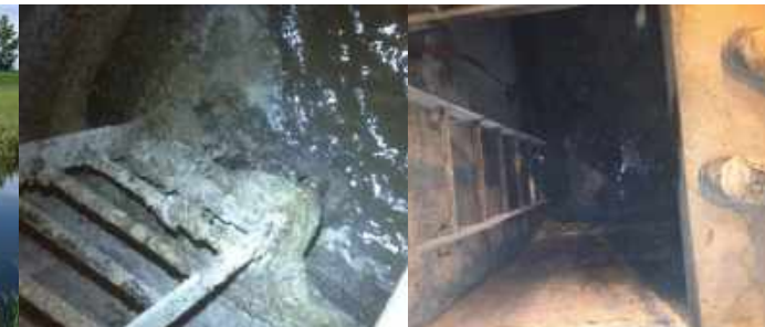
The transformation of a heavily overloaded lift station over 6 weeks using Acti-Zyme. No heavy equipment or labour needed.

Non-toxic, all natural, biological technology for rehabilitation and maintenance of wastewater systems.