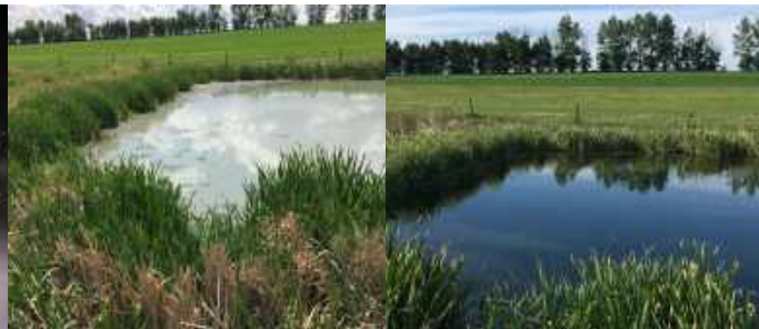
71% sludge reduction in one year, at 24% the cost of manual removal. No manual removal needed when using Acti-Zyme.