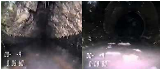
Full 24 km Pipeline Rehabilitation within 1 month. No manual removal needed when using Acti-Zyme.

"I have seen sludge build up 4 inches thick in pump stations, and seen it eaten away within 2 to 3 weeks after using the product. The walls were clean. Any of our traps or weirs is spotless. It is a fabulous product." Jacob Tricker, Alberta